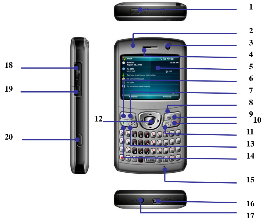
Front, top, bottom and left-side view